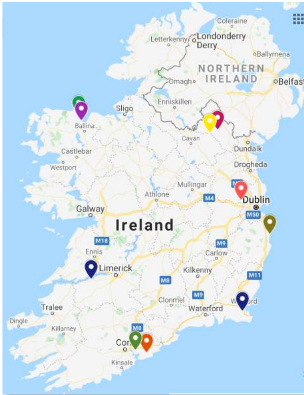
Figure 2. Map of confirmed cases of HPAI N5N8 in wild birds in Ireland in 2020 to date (18/12/2020)