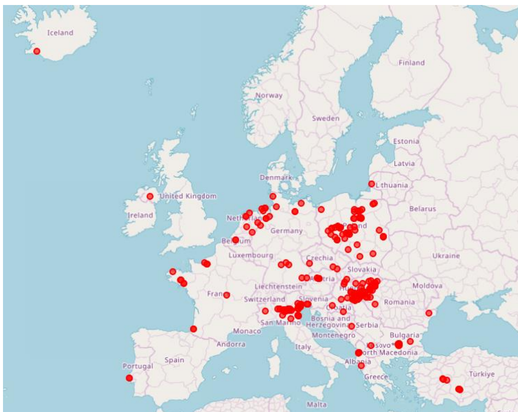
Figure 3. HPAI outbreaks in poultry flocks reported to the European Commission (01/10/2024-25/02/2025)