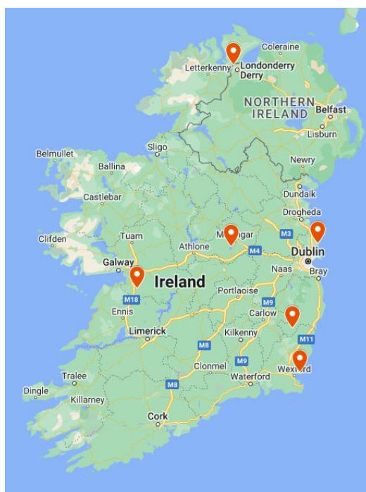
Figure 1: Location of wild birds with confirmed HPAI infection in Ireland